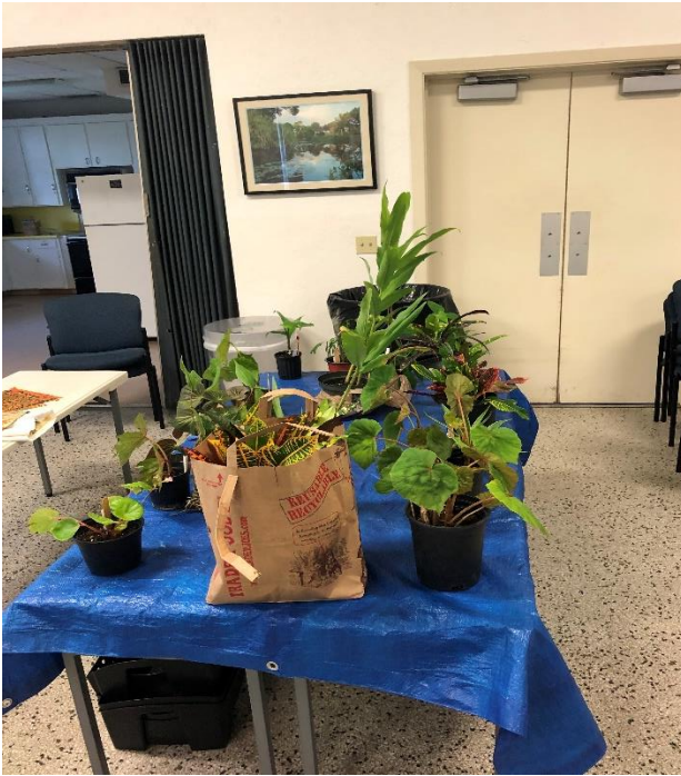
Plants available to Sell, Swap or Share

this. Let's face it, we all love plants and who doesn't get a thrill when they are able to bring plants home from our Begonia meetings?